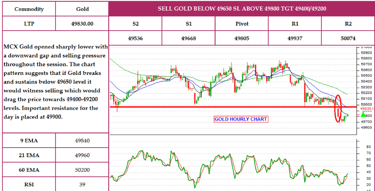
Chart of the days