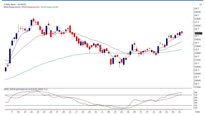
Exhibit 2: Nifty Bank Daily Chart