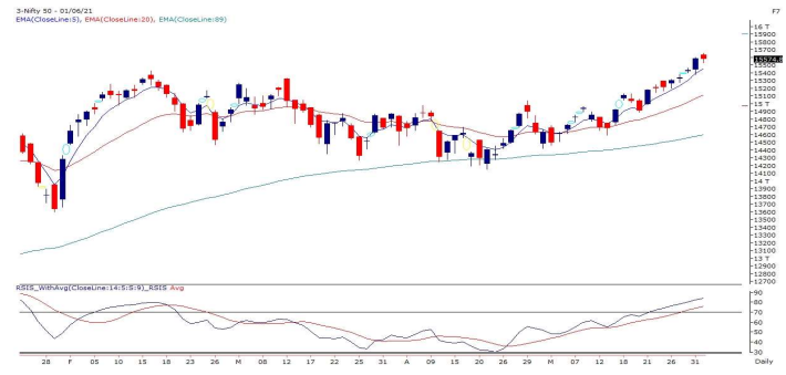
Exhibit 1: Nifty Daily Chart

Unlike previous sessions, the stock specific action yesterday was also not encouraging at all. The stock picking was a bit tedious task and hence going forward one needs to be very choosy while doing this exercise. We reiterate on avoiding aggressive bets and one should strictly follow a proper risk management.