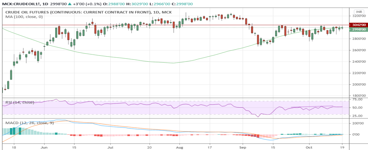
Chart of the day:

Day trend in CRUDEOIL may face resistance on daily chart which indicates sell signal if does not gives the breakout and sustains at it. So selling can be done in it.