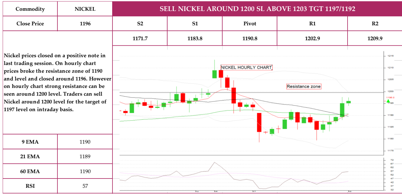
Chart of the day